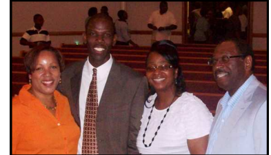
A Few of Our Pastor Friends