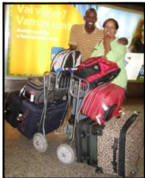
Whew! Now just a 5 hour wait & a 3 hour Bus Ride to go!